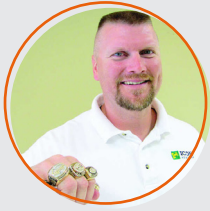
ADAM TIMMERMAN TWO-TIME SUPER BOWL CHAMP

A VIRTUAL LEADERS CONFERENCE SPEAKER TAKEAWAYS